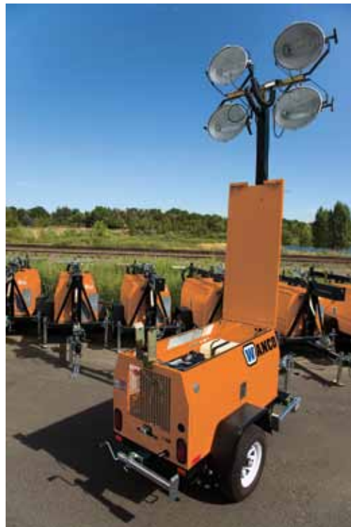
Hinged top panel opens fully. The light tower mast attaches to the panel for maintenance and raises the panel using the drawbar winch.

Wanco has created a unique innovation that greatly improves serviceability. For complete access to the engine, generator and electrical components, the Wanco Light Tower features a hinged top panel that rises with the mast when maintenance is required. No other light tower makes engine access this easy. The gull-wing side doors may be opened while the maintenance panel is raised, further enhancing access.