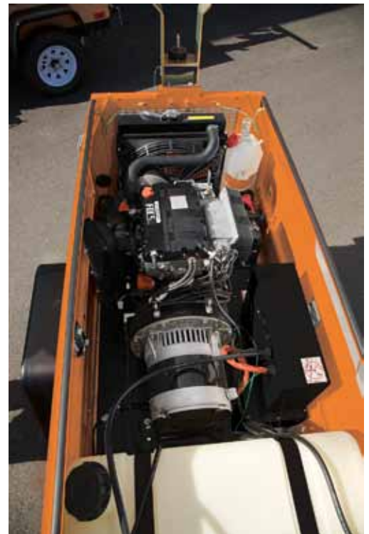
Engine and components are easily accessible with top panel up. Crossbar can be removed and side doors can be opened with panel raised.